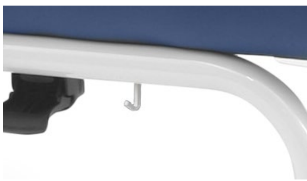
Support hook for drainage bag.