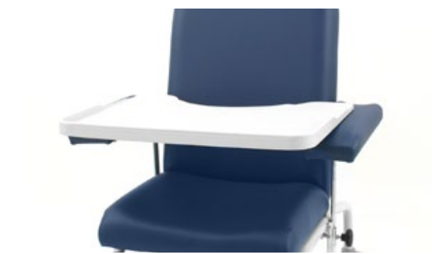
Table 60x47 cm wrap-around recess and folding edges Dx or Sx