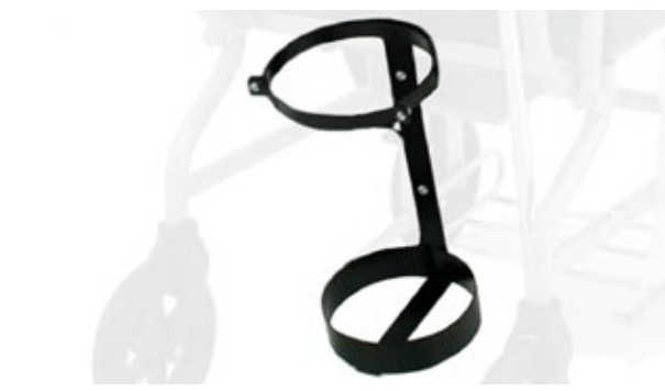
Oxygen cylinder holder basket.